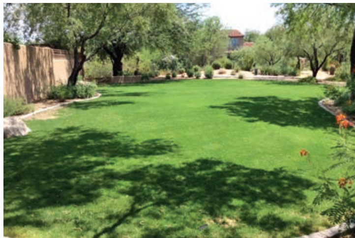
2014 non-overseeded spring turf

turf areas is reduced by half and mow heights are lowered to suppress the growth of the Bermuda and open up the soil for the rye grass. In addition, the turf is aerated to help the ground receive additional water and nutrients. After that, the rye grass seed is laid down. As the grass germinates, we will be watering frequently to keep the delicate seed bed moist. We encourage you not to walk or play on these areas as the grass germinates and until the new grass receives its first mow, typically in 3-4 weeks. In areas that aren't overseeded, we will work to keep the Bermuda grass green for as long as possible.