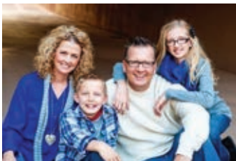
Grayhawk's Top Selling Agent! 2013, 2014

Sibbach Team Getting results for You and Your Family