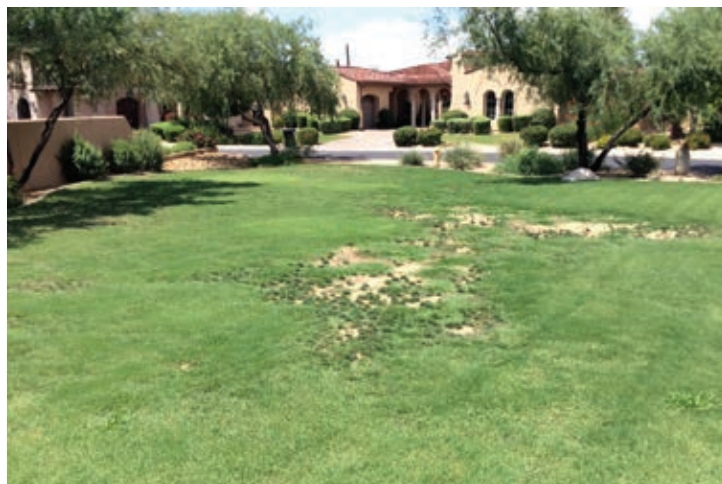
2013 overseeded spring turf

When DLC starts to overseed, typically the irrigation in the