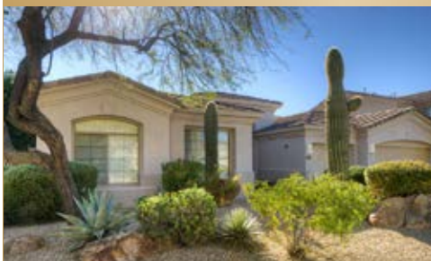
7431 E. Quill Lane - $610,000