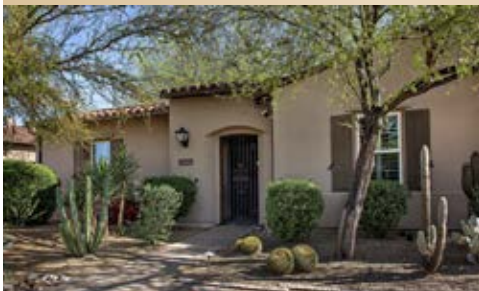
21325 N. 82nd St. - $1,125,000