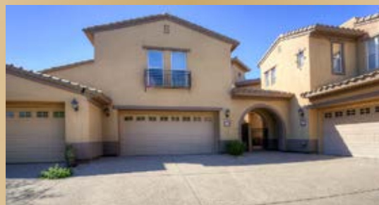
20801 N. Grayhawk Dr. #1067 - $399,000