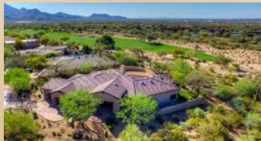
9290 E. Thompson Peak Pkwy #259 - $1,099,000